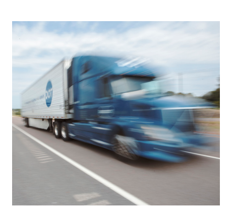
SPEED TO MARKET

Minimums | Only 1 Case Lead Time | 2-4 Days